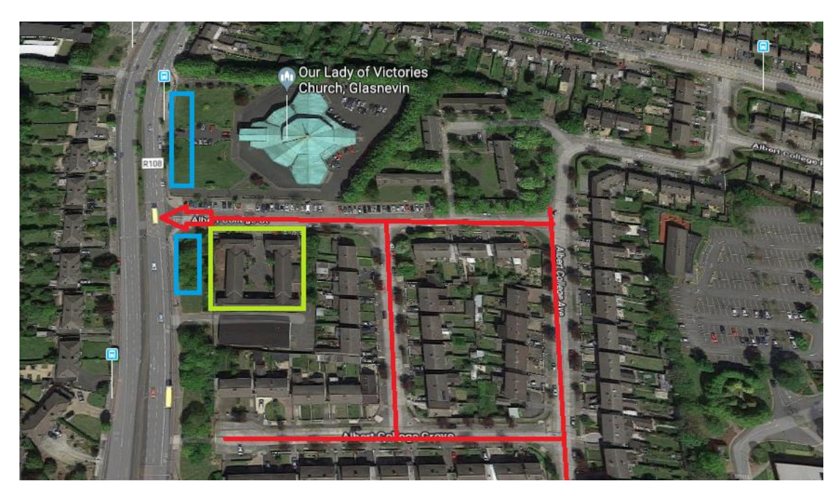
Figure 3: Albert College Station Map

The proposal for a station immediately to the west of Our Lady of Victories Church (marked in blue on the attached map) must ensure that there is effective traffic management is in place to ensure unimpeded egress and entrance from this estate onto the Ballymun Road via Albert College Court and Albert College Avenue(marked in red). In addition, as per the attached map there is directly south of the Our Lady of Victories Church, older persons accommodation owned by Dublin City Council. This is marked in green. Given the status of the residents of this development, I would assume that shielding barriers would be installed to protect individuals from dust and noise associated with the works for the duration.