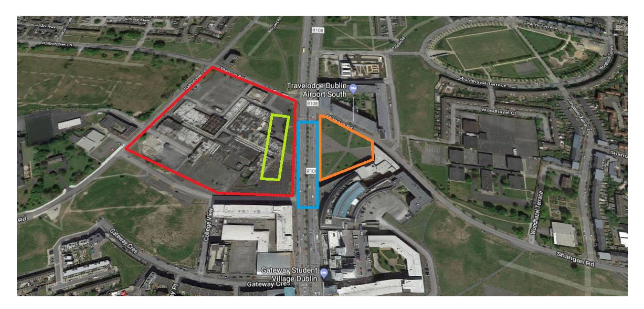
Figure 2: Ballymun Station Map