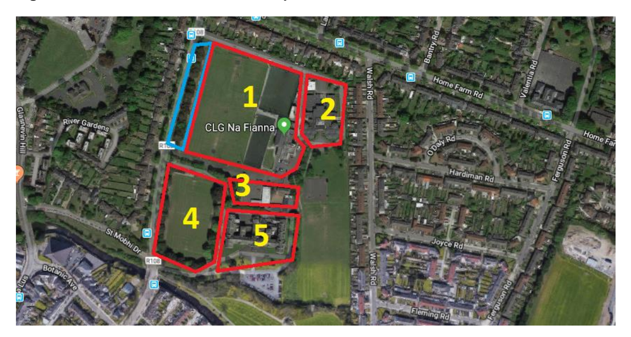
Figure 4: Griffith Park West Station Map